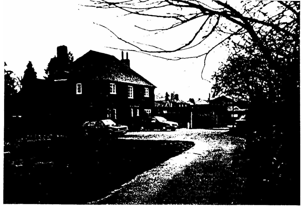
Superintendent's house, 30 Romsey Road.